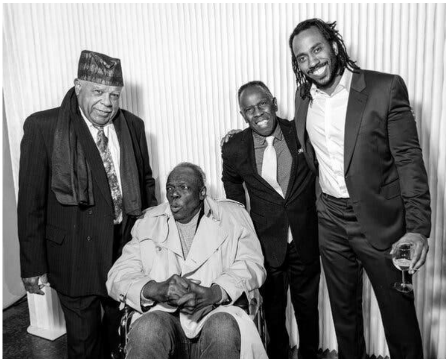
From left, Melvin Edwards, Sam Gilliam, Charles Gaines and Rashid Johnson at the 2019 Dia Art Foundation Fall Benefit, where Gilliam was honored.

"I knew his work far before we met, and he had so much influence on me," said Johnson, who has made his name with plant-filled installations and abstract, pandemic-era anxiety drawings. "He's been informing my life since I was in my late teens."