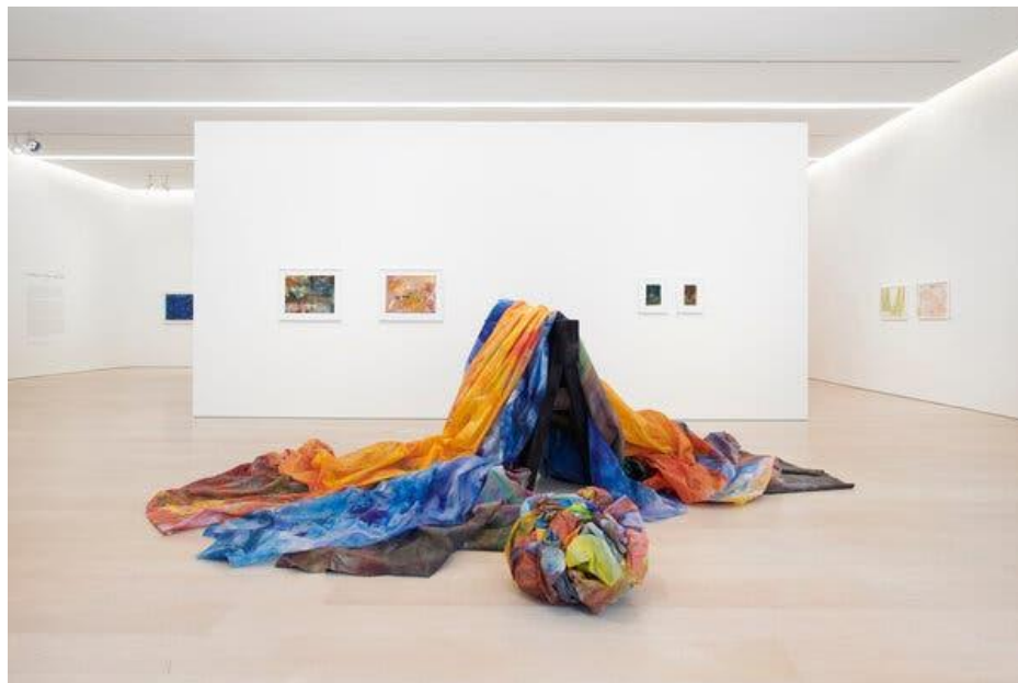
Installation view of Melvin Edwards, Sam Gilliam and William T. Williams: “Epistrophe.” It was presented this spring at Pace Gallery. Foreground, Gilliam’s “‘A’ and the Carpenter II,” 2022, which incorporates a sawhorse. Rear left, Williams’s work on paper. Center wall: four watercolors by Gilliam, 1967-74. Far right wall, works on paper by Edwards from 1974.

Sam was quite competitive, talking about wanting to win the game of art — artists don’t really talk that way now.