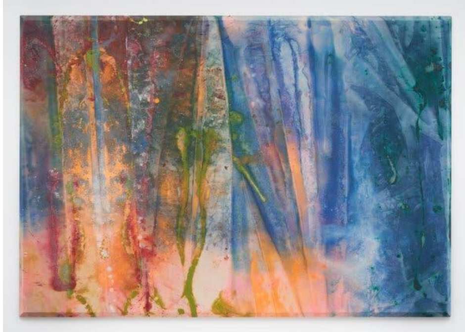
Sam Gilliam, “Dorothy’s Choice,” from 1967, acrylic on canvas. It was one of Gilliam’s “Beveled-Edge” paintings, and “as ambitious an innovation as the manumission of the canvas from the stretcher,” said Rashid Johnson.