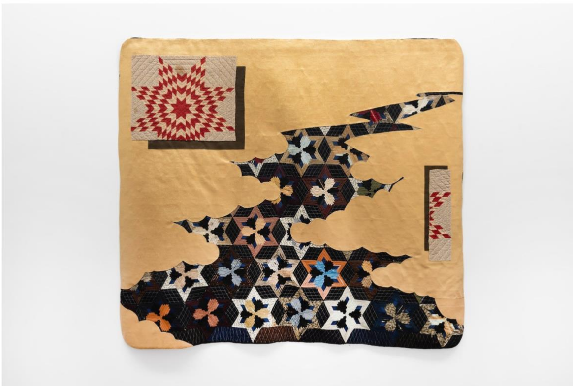
Sanford Biggers, "Moon Over Ninevah Bay" (2019) antique quilt, acrylic, assorted textiles; cleat / dibond, 68 x 6 inches

I also asked Biggers to explain a particular phrase that showed up in the advance press for the show which reads, "These quilts are an archive of an ongoing material conversation that acquires new meanings over time and trans-generational palimpsest for a future ethnography." Knowing the term "ethnography" from my own experience in graduate school from a fair amount of reading about social science methods, I know what that term means to me (a kind of behavioral map of the people of a particular community, which begins to describe the unspoken rules of belonging to that community), but I wanted to know what Biggers means by the use of the term.