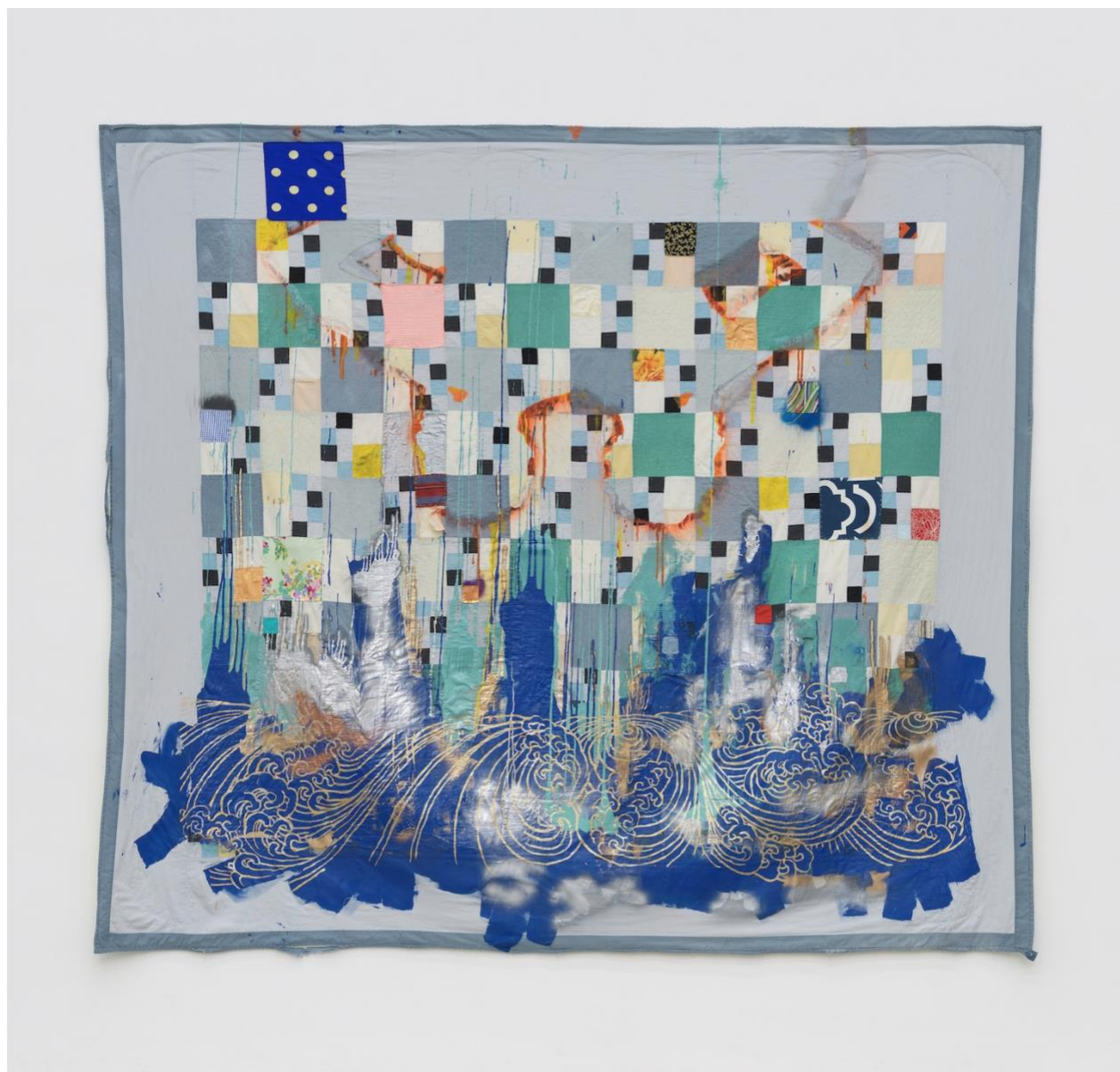
Sanford Biggers, “Harlem Blue” (2013), Antique quilt, additional textile, fabric treated acrylic, spray paint, 88 x 88 inches (image courtesy the artist)

All of these subjects might be doctoral dissertation topics, yet he flits from each to each paradoxically relying on intuition and conviction. He started out as a painter but he has grown into a syncretic compiler of all these interests and avenues of study. For the upcoming exhibition at the Bronx Museum of Art, Codeswitch , he has narrowed the medium bandwidth to focus on quilts. (Well, sort of, the museum indicates that the show consists of about 60 “quilt-based works” which include mixed media paintings and sculptures created directly on or made from pre-1900 antique quilts.) This choice gives me a way in to find out how quilts elucidate how he thinks through the above themes. In March, I spoke to Biggers when the exhibition’s spring opening was looming, before the global pandemic had fully touched down, to get some clarification on what binds together these disparate topics, concerns, and ways of working. What I found was that the quilts give Biggers a way to understand himself within an historical trajectory, a formalist genealogy, and the demands he places on himself.