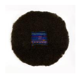
Sonya Clark (b. 1967, American) For Colored Girls, A Rainbow, B1, 2019 Wig, cast plastic combs, wrapped thread 12 x 12 x 3 inches Clar-1032-C