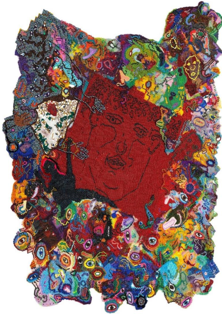
Joyce J. Scott, Garden Ensconced , 2024