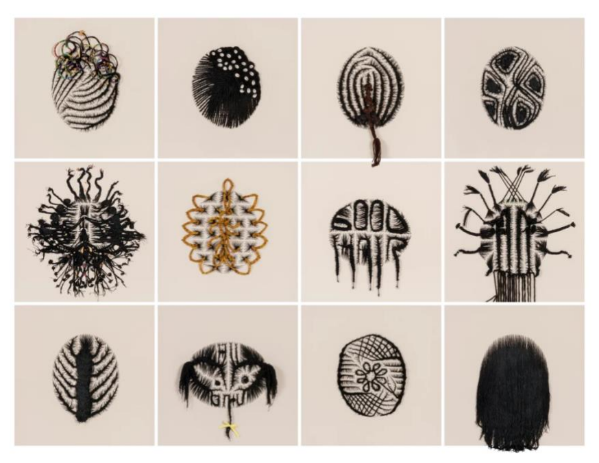
Sonya Clark, The Hair Craft Project: Hairstyles on Canvas, 2014, silk threads, beads, shells, and yarn on canvas, nine at 29 x 29 inches and two at 33 x 33 inches, Museum of Fine Arts Boston, the Heritage Fund for a Diverse Collection, Frederick Brown Fund, Samuel Putnam Avery Fund, and Helen and Colburn Fund.

adaption of the musical Show Boat. The song is a moving ballad that juxtaposes the toil and labor of Black folks working along the Mississippi with the river's incessant indifference. Sonya Clark resurfaces Robeson's performance in the musical as a cultural artifact that necessarily recounts the structural racism and violence endured by African Americans in the Jim Crow South. Clark's strands mimic the flow of the Mississippi whilst centering the Black kin who labored on it, were carried as chattel through it, and navigated to freedom along it, coils bending liquid and free.