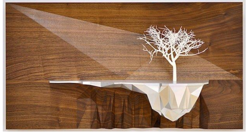
Ryan Hoover - Seed