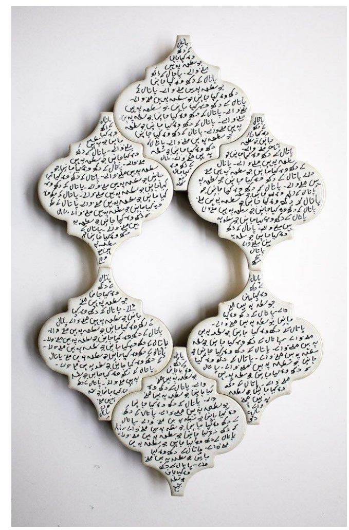
Sobia Ahamad - Contours of a Longing