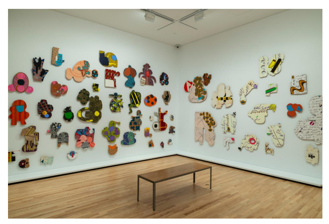
Installation view of The Mongrel Collection, 2019 at Baltimore Museum of Art.

work is an amalgamation of things--just like me.