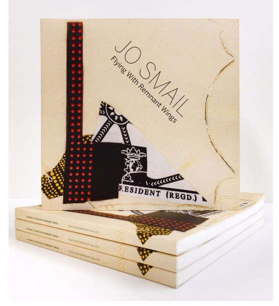
Cover of artist book in progress.