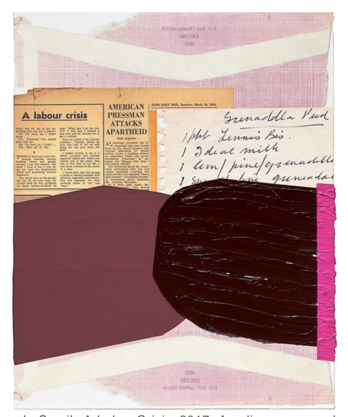
Jo Smail, A Labor Crisis, 2017. Acrylic, paper, and archival print on canvas, 50 x 40 inches.

In The Past is Present, curated by Goya Contemporary director Amy Eva Raehse, Jo Smail confidently expands her painterly approach by marrying tidbits of personal history with an accentuated use of collage. By incorporating personal content such as digitally scanned images of newspaper clippings, cooking recipes, antiquated advertisements, postage envelopes, as well as hand written notes and letters onto stretched canvases, Smail draws upon her South African upbringing and places the historical significance of these narratives front and center.