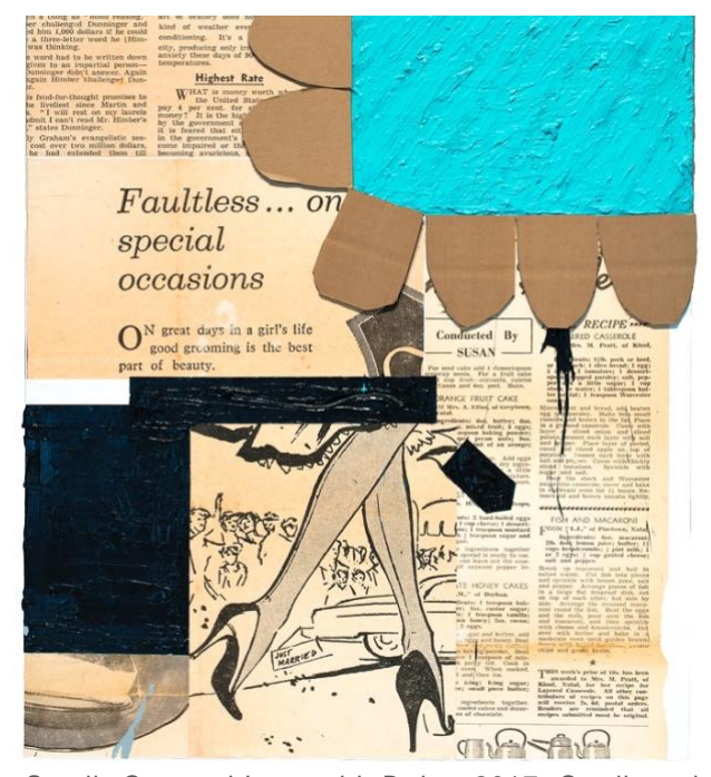
Jo Smail, Crossed Legs with Daisy, 2017. Cardboard, acrylic and archival print on canvas, 60 x 70 inches.

Thick paint on collaged content abounds in every painting in the show, but occurs most notably in The Laager Mentality, a whimsical fifty-by-forty inch painting that features twenty-two gray circles that appear to float on top of three collaged prints. Here, Smail explicitly explores the tension between legibility and obfuscation by burying portions of the newspaper's text with thick paint.