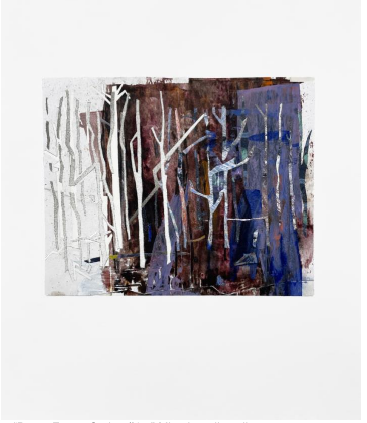
"Paper Forest Series #15," Mixed media collage on paper

All of Miller's scenes seem to capture winter days and stormy nights in the forest, through cool, dark, and gray tones. In the "Paper Forest Series #14" the forest is fractured and reassembled. The edge of the collage is rough. The scene is composed of flattened linear elements ranging in white, muted grey, deep purple, burnt siennas, and bits of yellow. The elements are tightly compressed together in organized chaos. These tones transport me to winter walks through Lake Roland Park where snow crunched under my feet and the landscape silent, but alive.